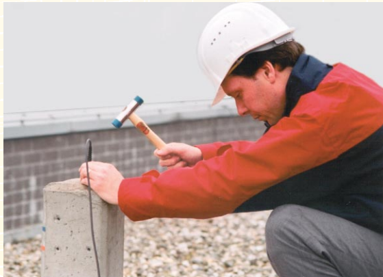
Checking piles with a SIT-system.

Prefabricated piles could have been broken and cast-in-place piles might have developed defects such as neckings and inclusions in the pile shaft.